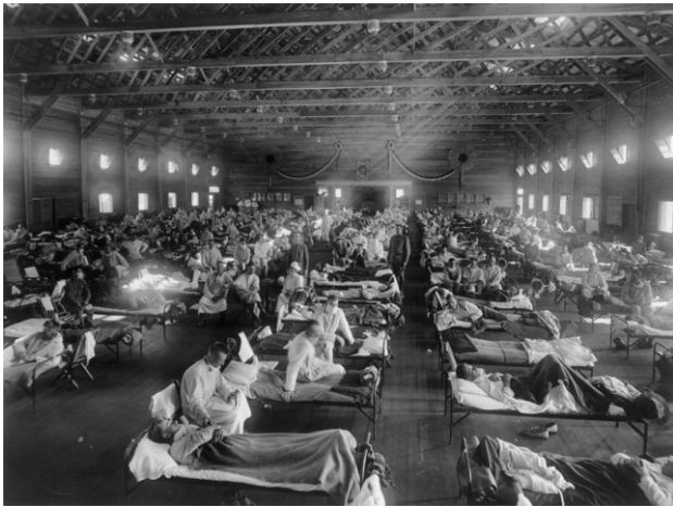
Figure 2. Emergency hospital at Camp Funston, a U.S. Army training camp in Kansas, where the first outbreak generally considered caused by 1918 pandemic influenza occurred (photographer unknown; courtesy of Otis Historical Archives, National Museum of Health and Medicine, Silver Spring, MD, USA).

clearing stations for one day was reached on 25 June with 683 admissions. 13 Correspondingly, the French Army was evacuating 1500–2000 cases of influenza to the rear of the front per day in May 1918. 4 In his fictionalized autobiography, Siegfried Sassoon, one of the leading British war poets, described the impact of the disease, despite its mild character, on military operations: “The influenza epidemic defied all operation orders of the Divisional staff, and during the latter part of June more than half the men in our brigade were too ill to leave their billets.” 14 Likewise, German General Erich Ludendorff, joint commander of the German Army, acknowledged the suffering of his army: “Influenza was rampant [...]. It was a grievous business having to listen every morning to the chiefs of staffs’ recital of the number of influenza cases, and their complaints about the weakness of their troops if the English attacked again.” 15 Eventually, the first wave subsided in the beginning of the summer of 1918, 9 although, as General Ludendorff acknowledged, “it often left a greater weakness in its wake than the doctors realized”. 15