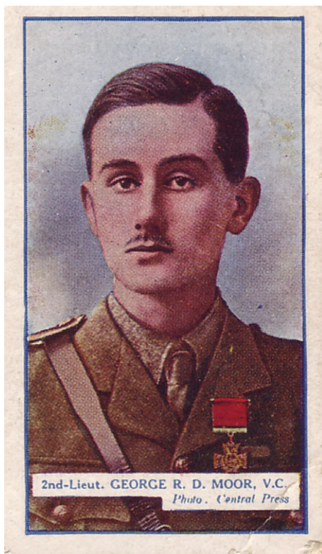
Figure 7. While “influenza produced no heroes”, heroes themselves were not immune to the disease. British Army officer George R.D. Moor, who was awarded the Victoria Cross, the Military Cross, and an additional Bar to the Military Cross, died from 1918 pandemic influenza on November 3, 1918 at the age of 22. He is depicted on a so-called cigarette card commemorating First World War Victoria Cross recipients issued by tobacco company Gallaher Ltd.

In view of the reigning German soldier cult, which heroicized death and sacrifice on the “altar of the fatherland”, 3 it can be considered far from glorious for a soldier to have died from influenza in a hospital bed behind the front line, removed from trenches, mud, barbed wire, shells, and bullets. Likewise, in the U.S. Army, death in combat was valorized over death by disease. The most glorious was to be killed in action against the enemy, or to die of combat wounds. Only “weaklings” died in bed of a fever. 4 Yet, while “influenza produced no heroes”, 4 heroes themselves were not immune to the disease. British Army officer George R.D. Moor, who was awarded the Victoria Cross, the highest British military decoration for valor in the face of the enemy, the Military Cross, a British military decoration in recognition of exemplary gallantry against the enemy on land, and an additional Bar to the Military Cross, died from 1918 pandemic influenza on November 3, 1918 at the age of 22 (Figure 7). 40