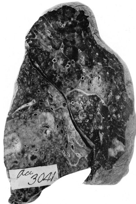
Figure 5. Lung specimen obtained during autopsy of an unknown individual who died of influenza-related pneumonia (accession number 3041, Army Medical Museum). Peribronchiolar consolidations were observed in both lobes extending out from thickened interstitial tissue at about the middle of the upper lobe. Culture revealed Streptococcus hemolyticus , currently referred to as \beta -hemolytic streptococci.

produce highly lethal pneumonias. 26 Concurrently, Morens et al. reported results of the examination of recut sections from lung tissues obtained during autopsies from 58 influenza fatalities in 1918–1919 at various U.S. Army training camps, archived at the Armed Forces Institute of Pathology (Figure 5). In virtually all cases, compelling histologic evidence of severe acute bacterial pneumonia was revealed. The observed histopathologic spectrum ranged from lobar consolidation with pulmonary infiltration by neutrophils in pneumococcal pneumonia, a bronchopneumonic pattern, edema, and pleural effusions in streptococcal pneumonia and occasionally pneumococcal pneumonia, and multiple small abscesses with marked neutrophilic infiltration in airways and alveoli in staphylococcal pneumonia. Bacteria were commonly observed, often in massive numbers. Correspondingly, bacteriologic and histopathologic results from previously published autopsy series also clearly and consistently implicated secondary bacterial pneumonia caused by common upper respiratory tract bacteria in most 1918 pandemic influenza fatalities. Bacterial culture results additionally implicated H. influenzae to appear early in symptomatology in association with diffuse bronchitis and/