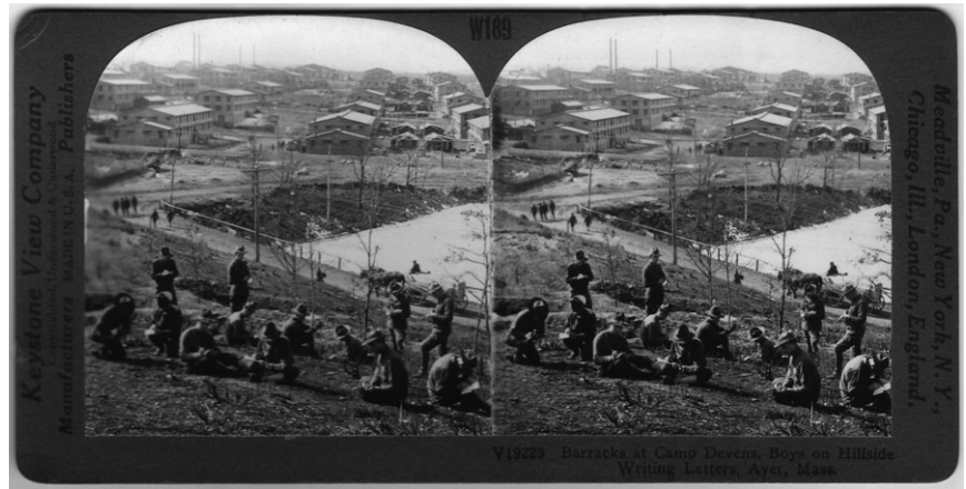
Figure 3. First World War era stereocard view of the barracks at Camp Devens in Massachusetts, which was the first U.S. Army training camp hit by the deadly second wave of 1918 pandemic influenza with more than 14 000 cases and 757 deaths.